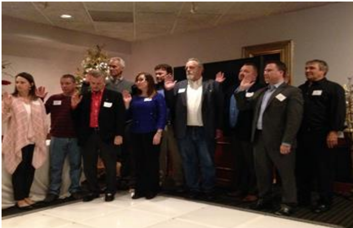
Swearing in of the 2017 Bluegrass Chapter Officers and Board of Directors.