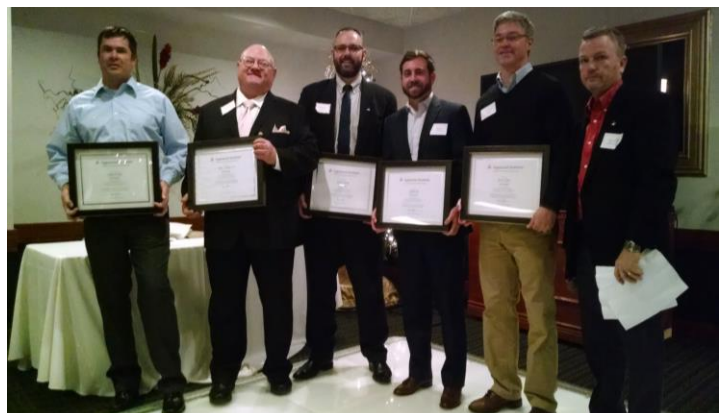
Bluegrass Members receiving their recent designation certificates at the Xmas Dinner.